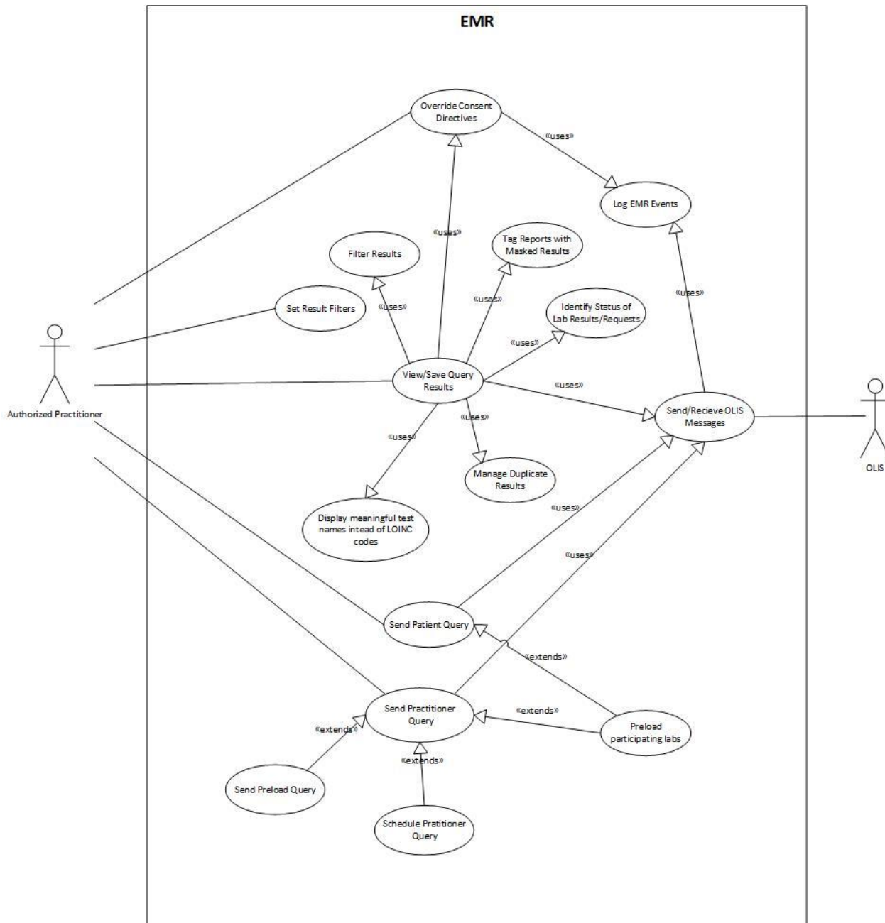
Figure 1 - EMR-OLIS Business Use Case